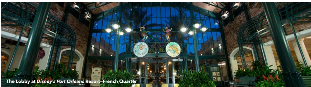
The Lobby at Disney's Port Orleans Resort—French Quarter