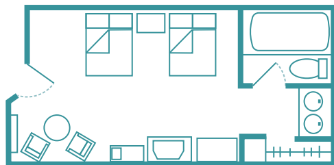
Typical Standard Room, Parking Areas & Landscaping View, with two queen beds, 314 sq. ft. Accommodates up to four Guests plus one child under age 3 in a crib.