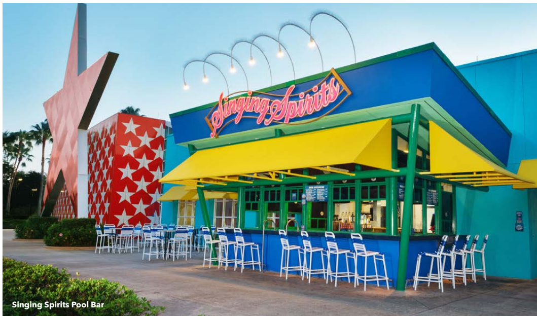
Singing Spirits Pool Bar

Let the spirit move you with a chorus of specialty cocktails, beers and wines by the Calypso Pool.