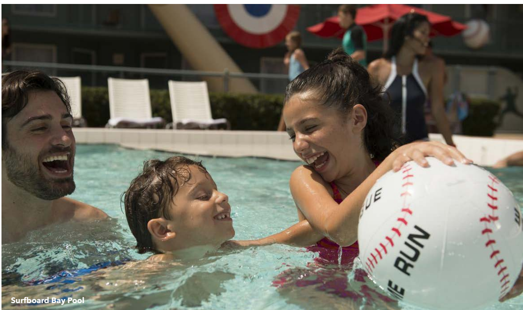
Surfboard Bay Pool