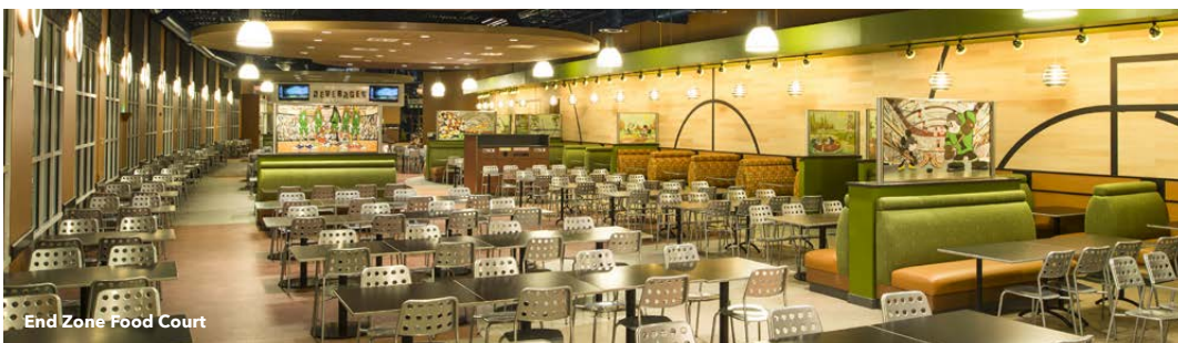
End Zone Food Court

Bus Service to Walt Disney World® Resort Theme Parks, Water Parks and Disney Springs®