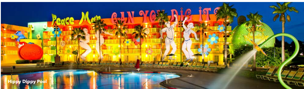
Hippy Dippy Pool